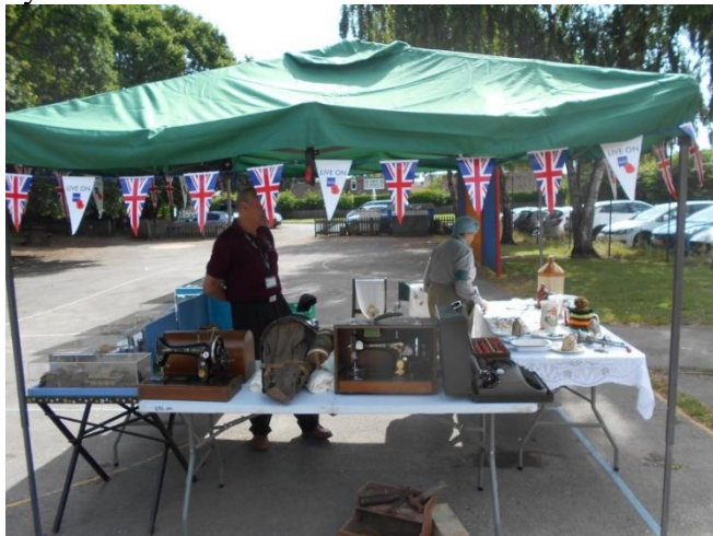
Kingsclere RBL supporting the Kingsclere School WW2 Project

A key theme on our branch plan is to provide support to the wider village community including the Guides, Scouts, Parish Council and school; a number of our branch put on a display for the village school in July as part of their WW2 themed project. A pop up museum of “show and tell” items were put out and a great day was had by all.